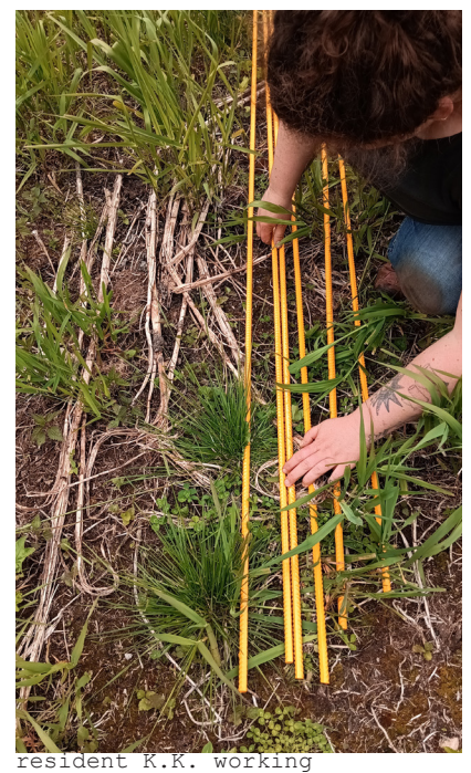
resident K.K. Working

to the farm. Here you will have access to a wide selection of professional tools for working on your projects.