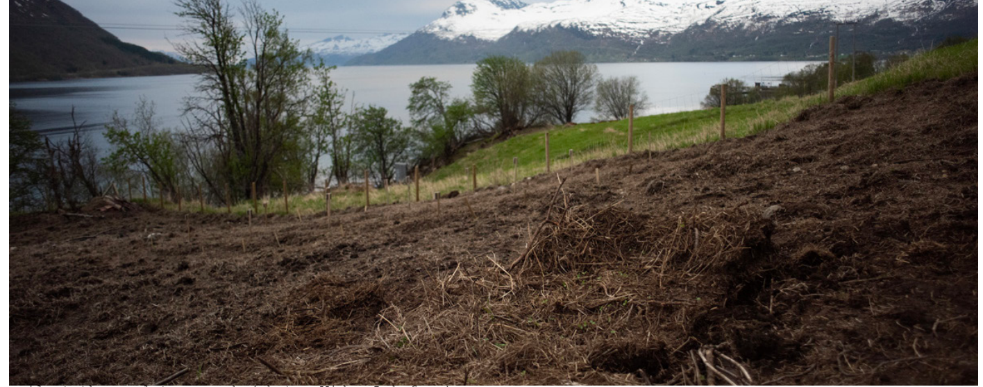
soil at the sculpture park

and use this as your source and frame for practical and theoretical research. Your artistic work should culminate in a public event and a written document about your process and experiences. The public event can for example be an exhibition, a lecture, a performance, a film or a panel discussion.