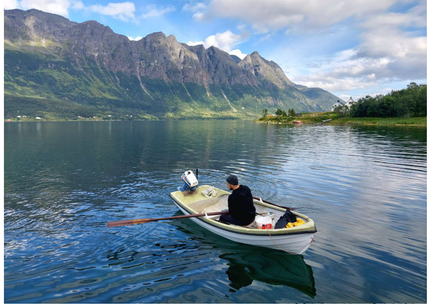
resident P.P in boat