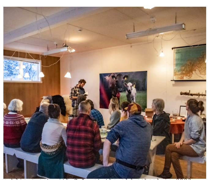
public event with S.L. at the old school in 2023

Lavangsnes Wunderkammer announces an engagement within our interdisciplinary residency program for 2024! We are open for applications from artists / other creative people whose work relates to visual arts in all formats, writing, film or other disciplines. The residence is located at Lavangsnes, a pittoresque old fisher/farmer village in the Arctic part of Northern Norway.